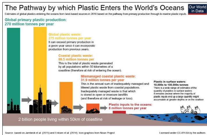
Figure 1: How Plastic Ends up in Oceans

The first synthetic plastic was made in 1907, marking the world's plastics industry's beginning. However, the rapid growth in global plastic production took place only in the 1950s. Over the next 65 years, the annual production of plastics increased nearly 200-fold to 459.75 million tons in 2019. This is roughly equivalent to the mass of two-thirds of the world's population. At the global level, best estimates suggest that approximately 80 percent of ocean plastics come from land-based sources and the remaining 20 percent from marine sources. Of the 20 percent from marine sources, it is estimated that around half originates from fishing fleets (such as nets, lines and abandoned vessels). It is supported by figures from the United Nations Environment Programme (UNEP), which suggests abandoned, lost, or discarded fishing gear contributes approximately 10 percent to total ocean plastics.